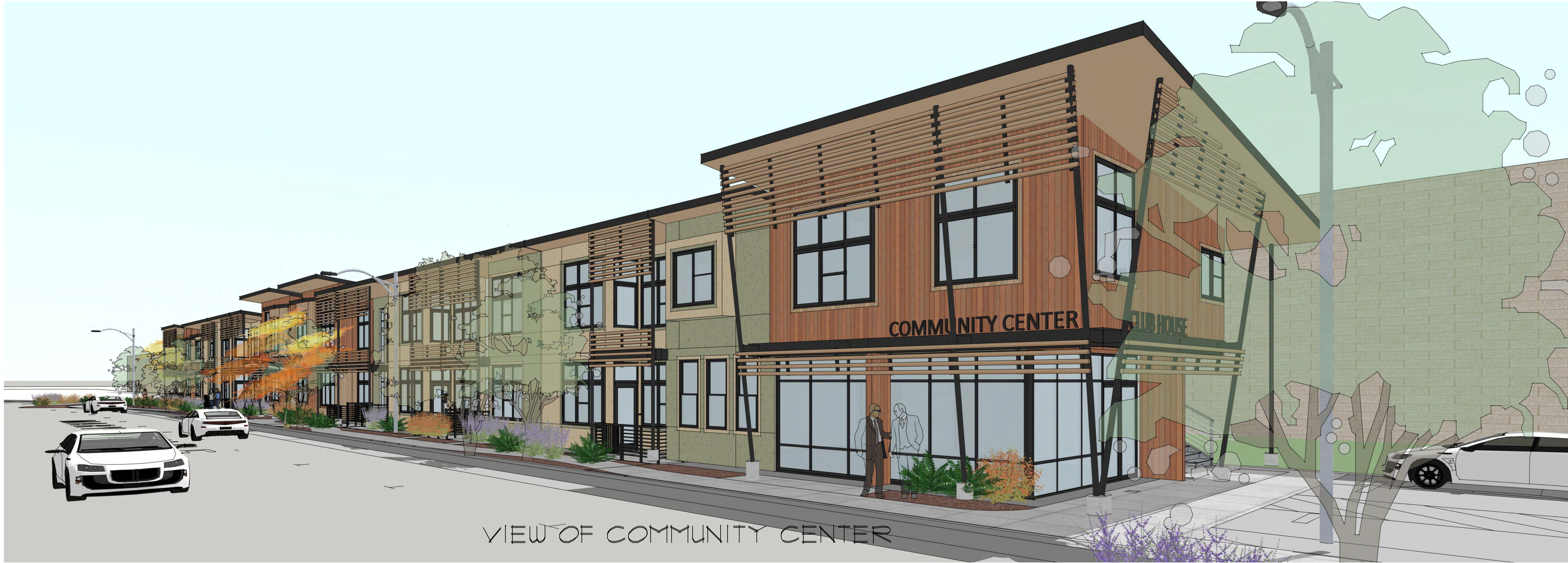
VIEW OF COMMUNITY CENTER