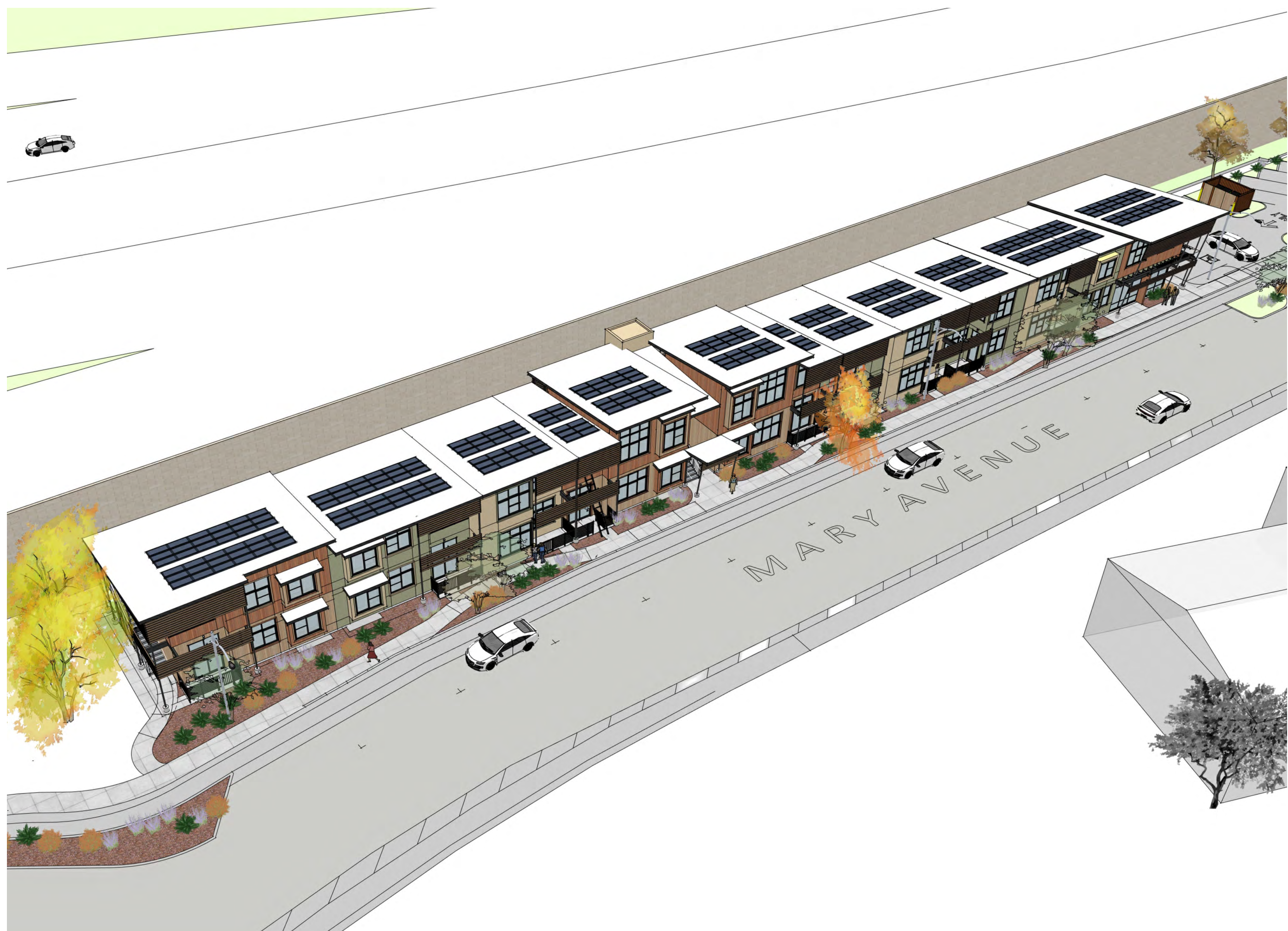
BUILDING 1 BIRDEYE VIEW - 2