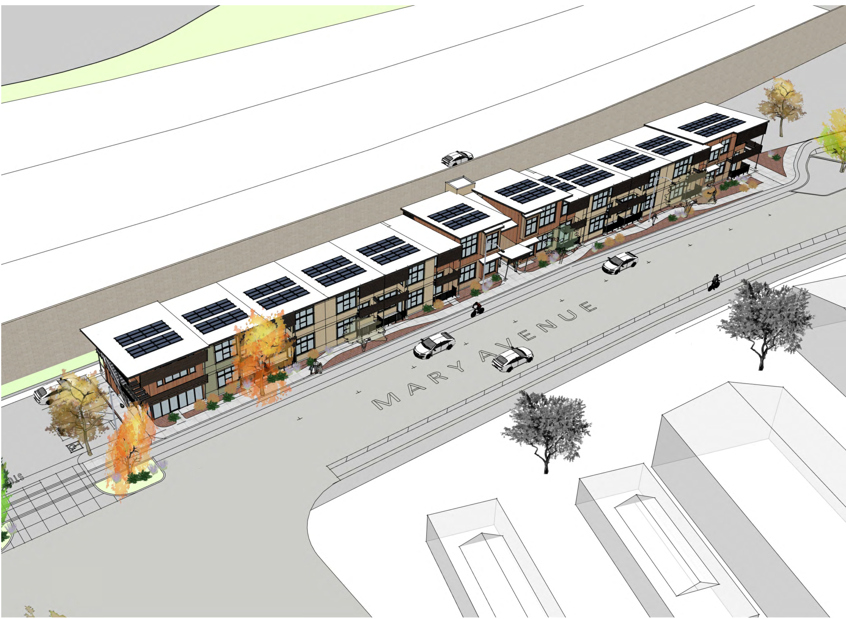
BUILDING 2 BIRDEYE VIEW - 3