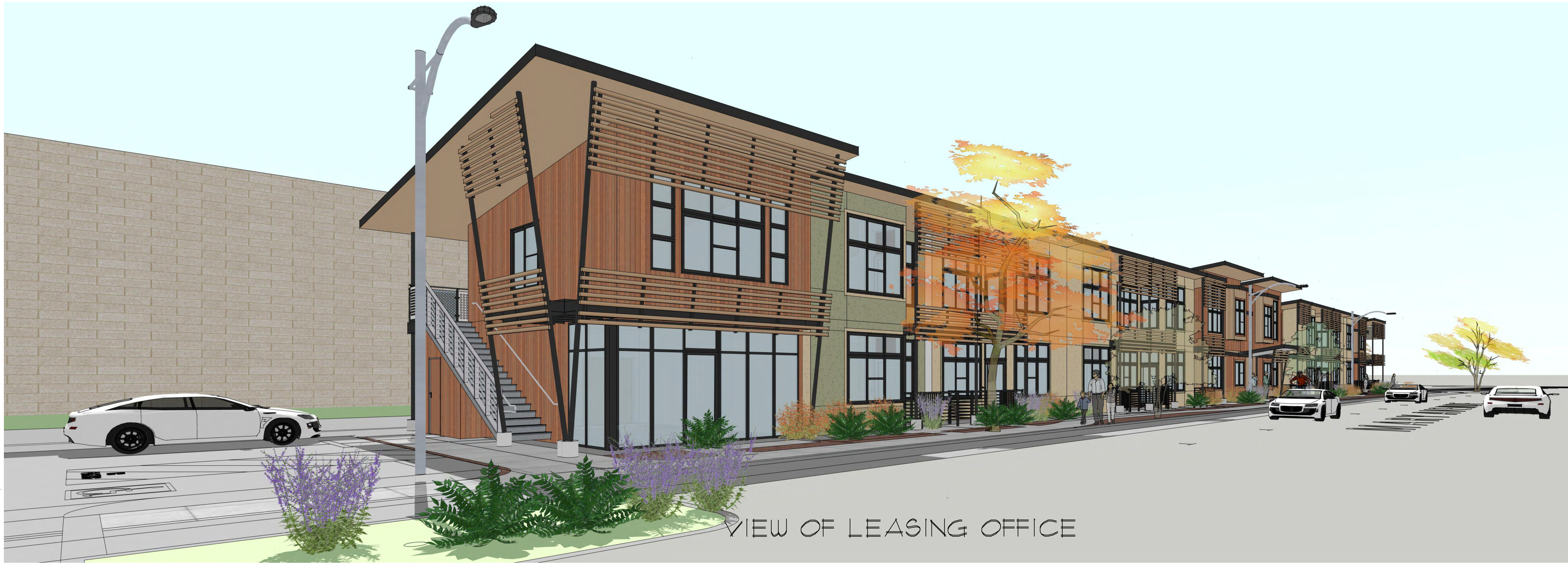
VIEW OF LEASING OFFICE