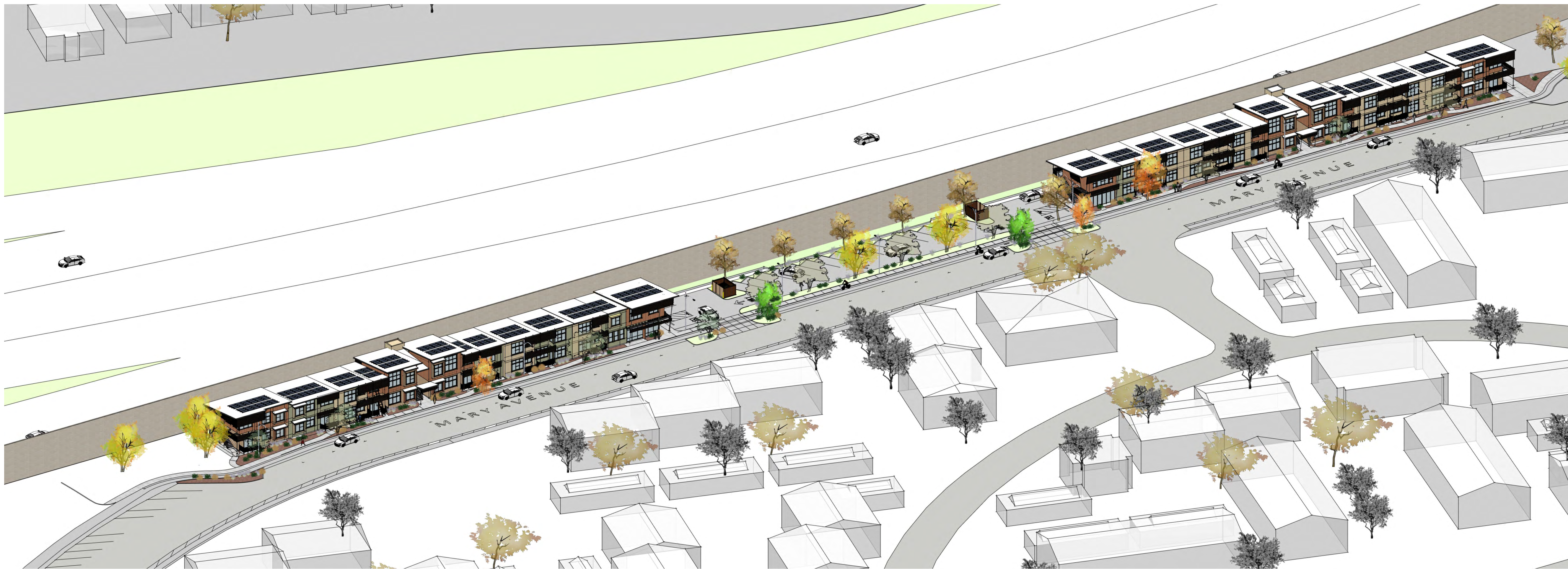
OVERALL BIRDEYE VIEW - 1